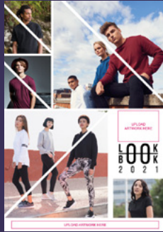
COVER B 69(w) X 60(h)mm* 190(w) X 10(h)mm*