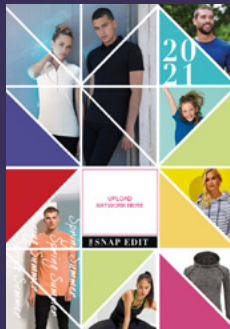
COVER B 69(w) X 60(h)mm*