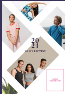
COVER C 55(w) X 70(h)mm*