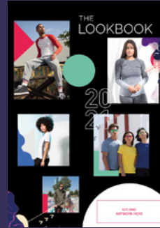
COVER D 85(w) X 30(h)mm*