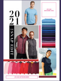
COVER E 53(w) X 53(h)mm* 117(w) X 10(h)mm*