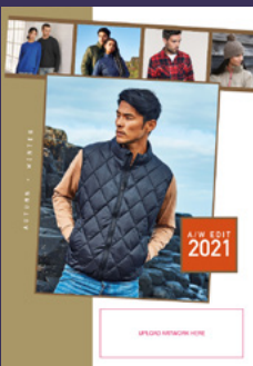
COVER A 118(w) X 40(h)mm*