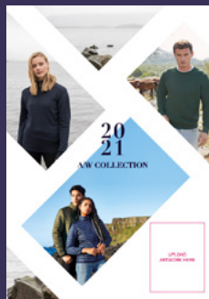
COVER C 55(w) X 70(h)mm*

For all artwork supplied, please use a file sharing service (e.g. WeTransfer or MailBigFile) to: