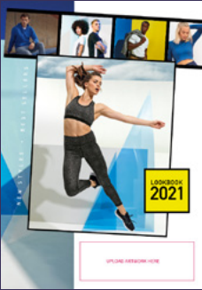
COVER A 118(w) X 40(h)mm*