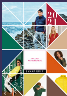
COVER B 69(w) X 60(h)mm*