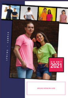
COVER A 118(w) X 40(h)mm*